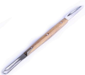
3. Wax Modeling Carver Knife