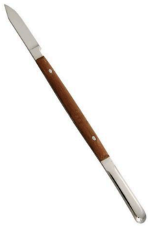
1. Carving Spatula (Flat)

During the educational year of 2025-2026, the following Materials & Instruments are needed throughout the practical sessions: