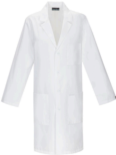
6. White lab coat

Note: You can also collect these materials(1,2,3,4,5,6) from the Dean's Office if you come with the invoice along with the payment: