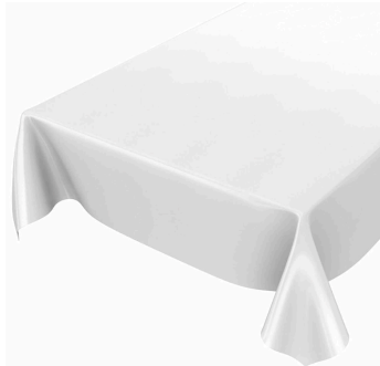
5. Vinyl tablecloth